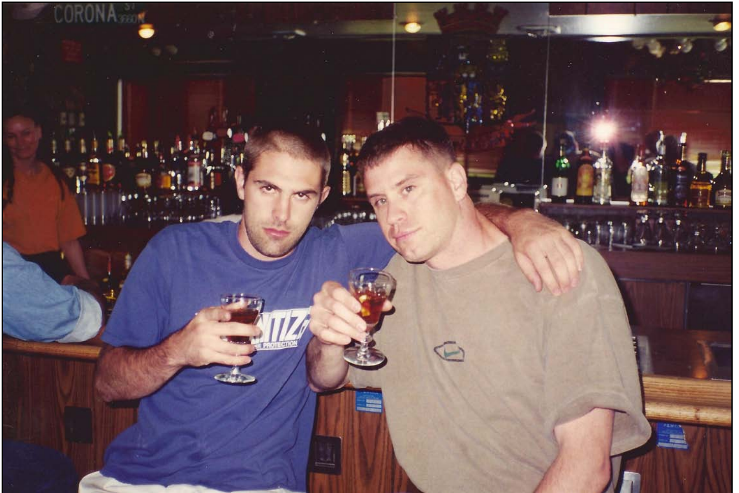
SNC 1 – “The JB” and “Spiderman” are on their way to kissing the moose in the Basque Country Club Bar.