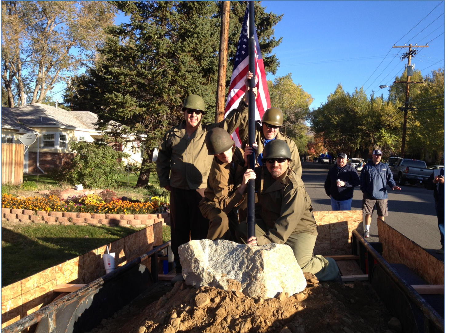
...On The Sands Of Iwo Jima