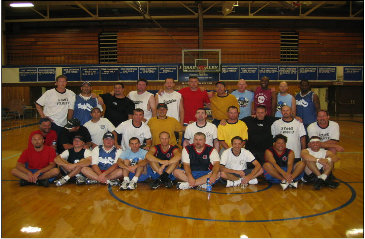
SNC 10: In our youth.