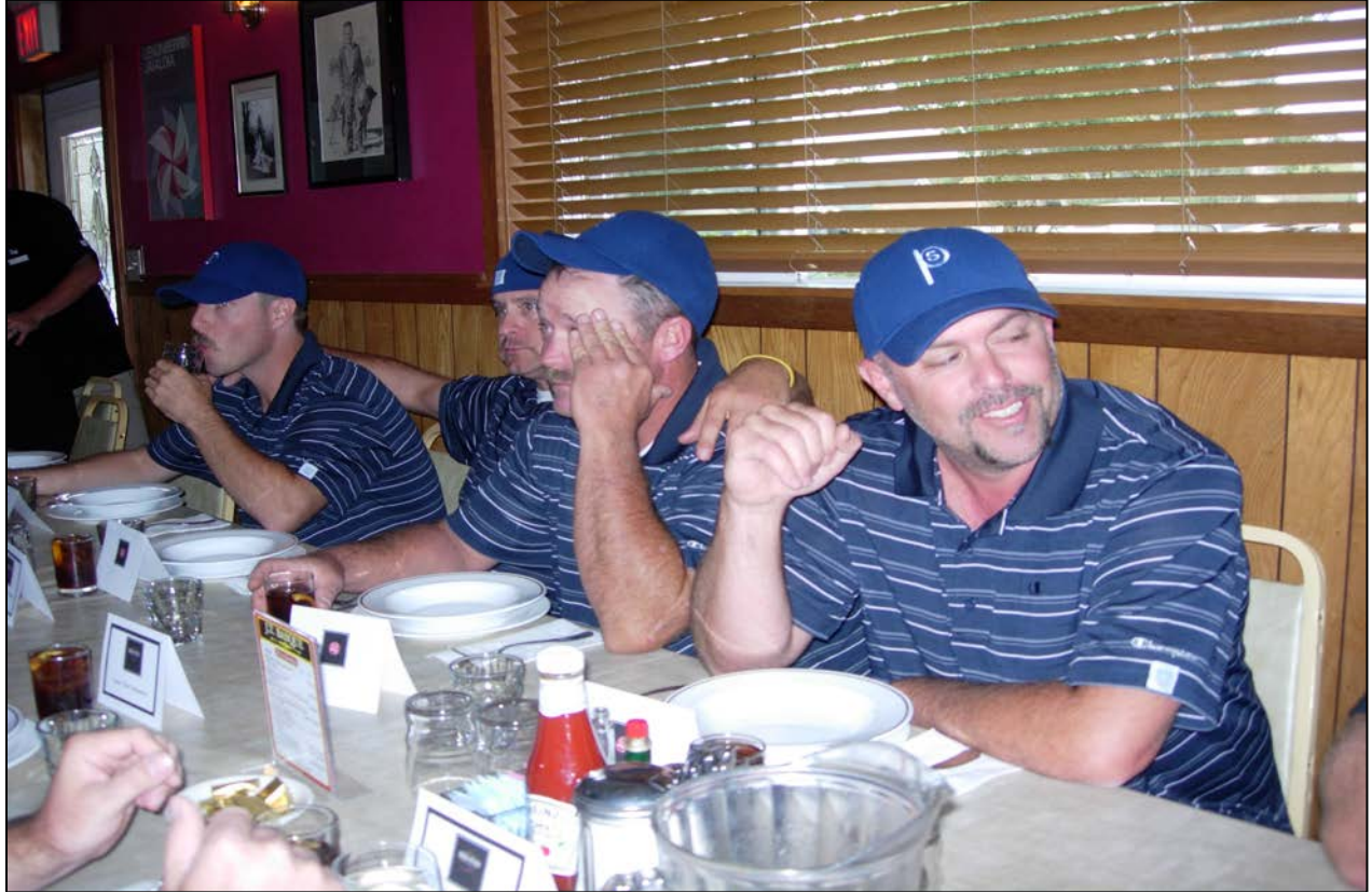
SNC 15: Point Shavers prepping for lunch.