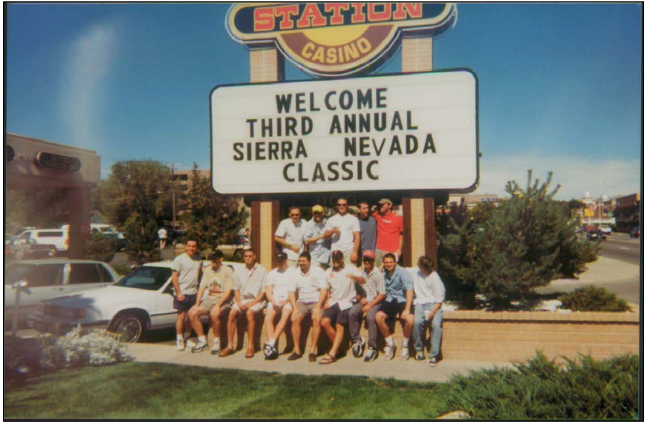
SNC 3: Pre-Electric Sign.