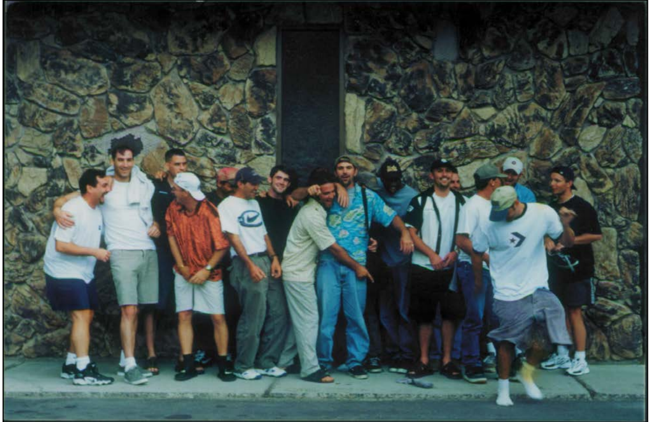
SNC 4: Greez's Fire Dance.