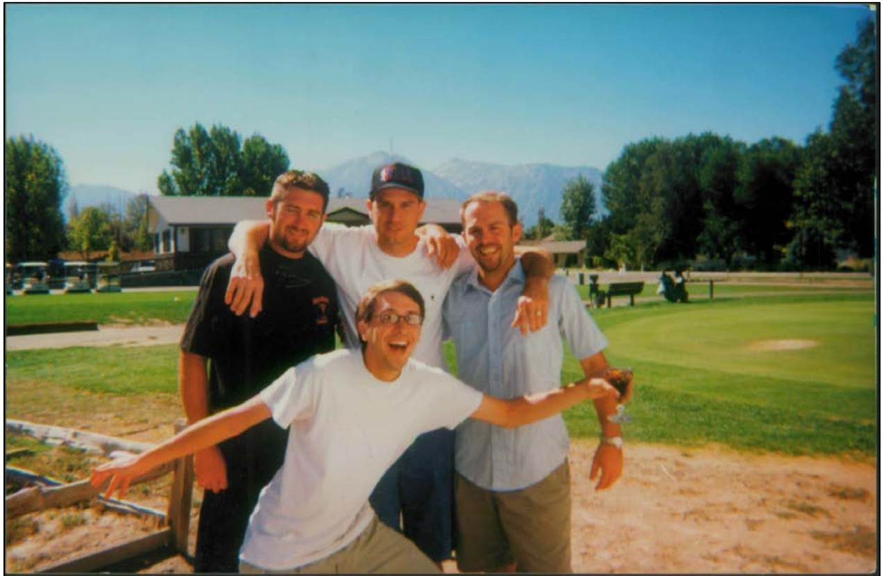
SNC 2: Ye Olde Country Club.