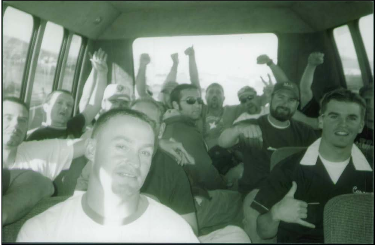
SNC 5: Carson Valley Limo.